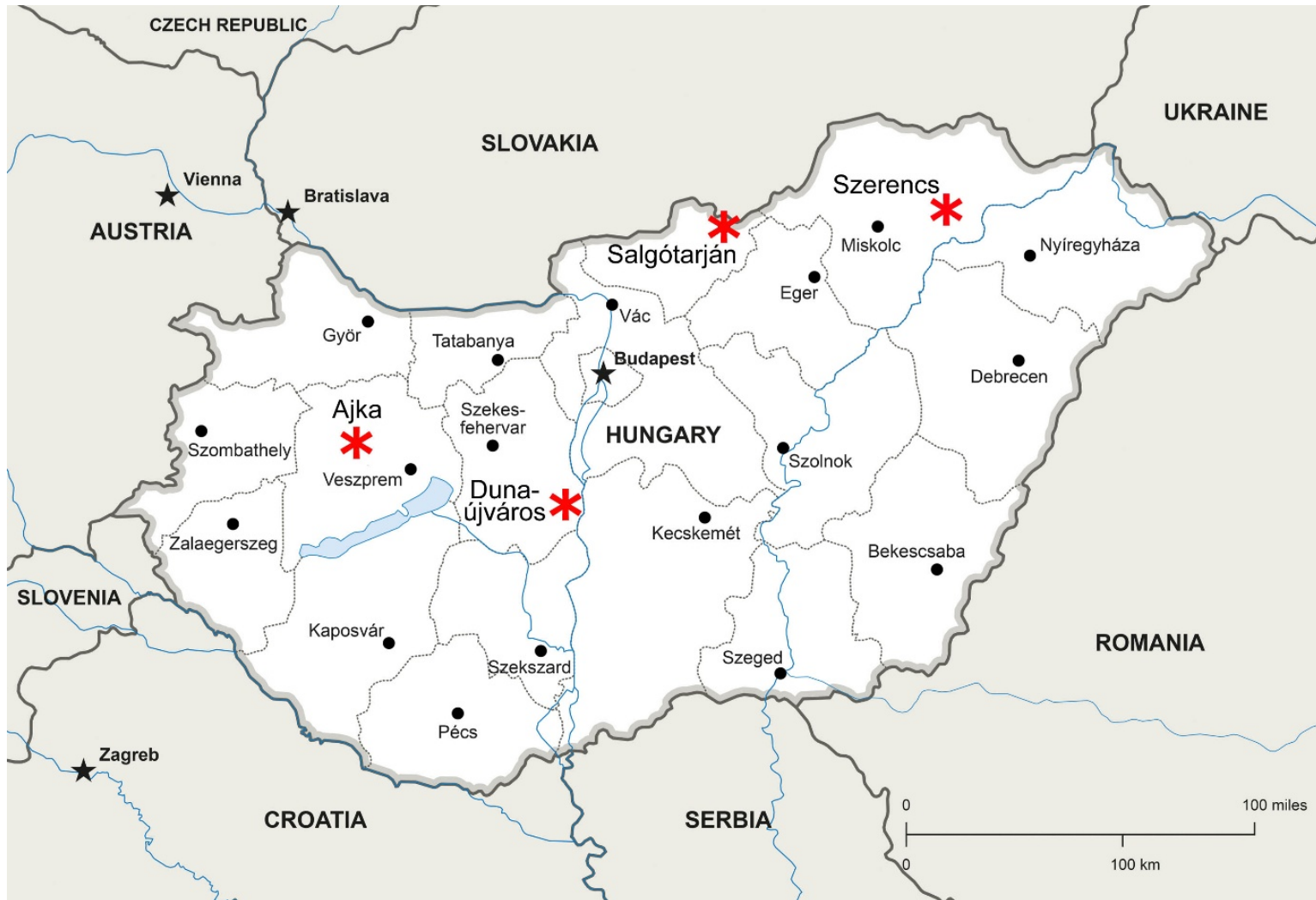
Figure 1. Fieldwork map