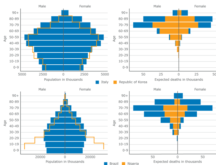
Figure 1. Population composition (left) and expected deaths in population (right), Italy and the Republic of Korea (top), and Nigeria and Brazil (bottom). Projections assume 10% population infection rate and current age-sex-specific case fatality rates from Italy.

Furthermore, spatial disparities also create a risk. Kashnitsky and Aburto (2020) looked at differences in local population age structures across European