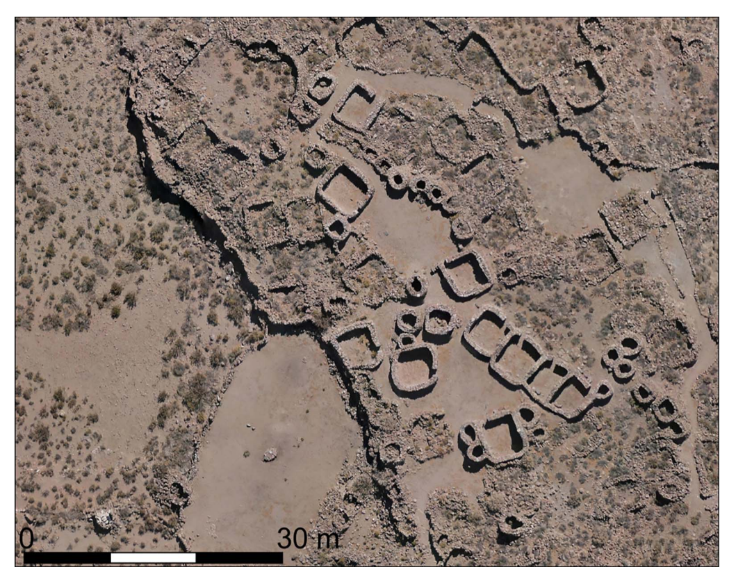
Figure 3. Aerial view of the Loma Pucara site of Ayque (Intersalar Region, Potosi, Bolivia), an altiplanic settlement of the Late Intermediate Period, around AD 1300.