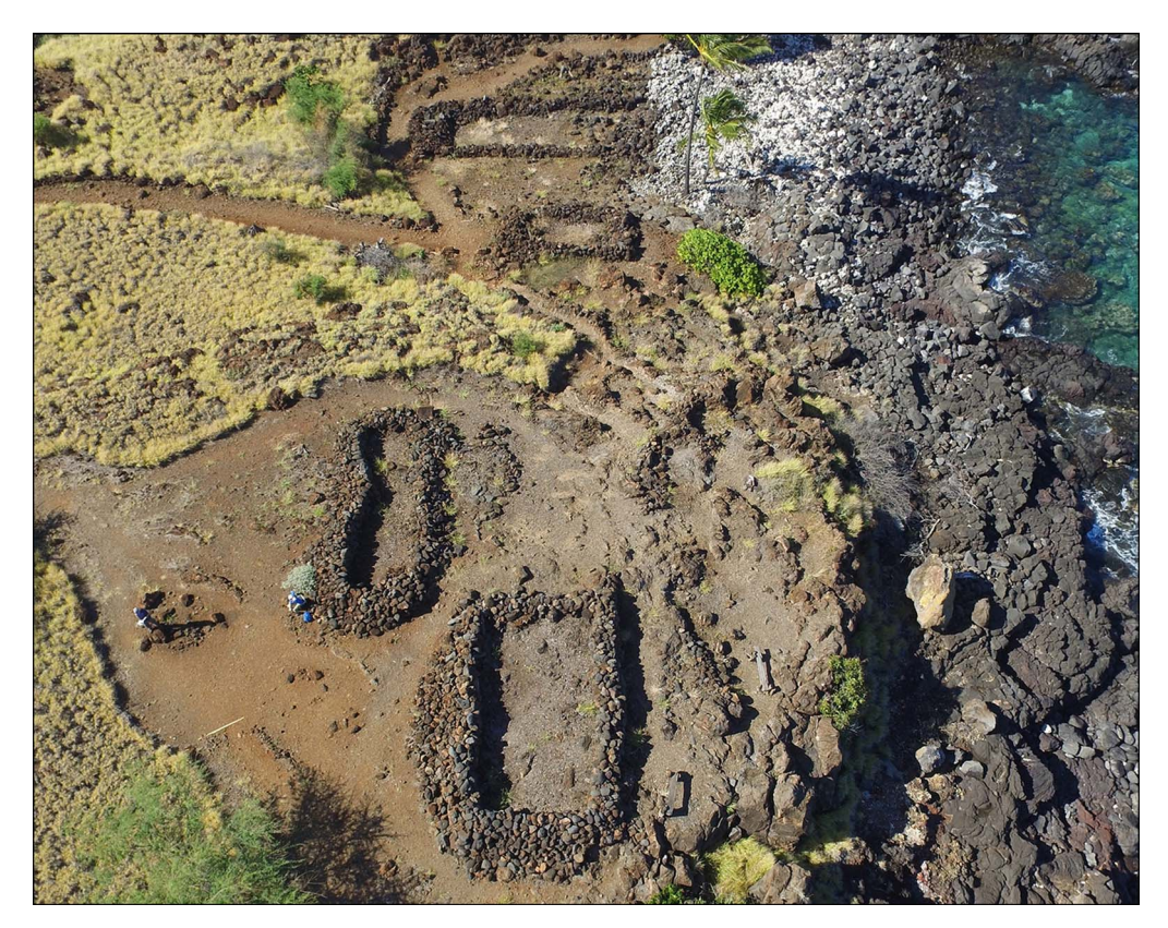
Figure 2. Aerial view of stone foundations of houses along the coast of Hawai'i Island, Lapakahi State Historical Park.

It has been argued that human societies have a persistent attraction to inequality (Scheffer et al. 2017; Chase et al. 2020), reflected in the skewed degree distributions of network science, where a few nodes have more links than the rest (Bettencourt 2021). Mobile foragers have often been characterised as classless, but some hunter-gatherer-fishers developed marked wealth inequalities, including on a seasonal basis (Wengrow & Graeber 2015; Mattison et al. 2016; Pandit et al. 2020). Wealth inequalities can intensify with the implementation of agriculture, a process apparently amplified by domesticated animals (Kohler et al. 2017; Styring et al. 2017). Within a few millennia of agricultural emergence, some societies exhibited enormous wealth and power differences, while others apparently suppressed high inequality and have attracted particular scrutiny by archaeologists (e.g. McIntosh 2005; Graeber & Wengrow 2021; Green 2021). Preserved housing evidence, such as the stone house foundations of Hawai'i Island (Figure 2) and houses and granaries in the Intersalar region, Bolivia (Figure 3), provide key data on past wealth distributions among households.