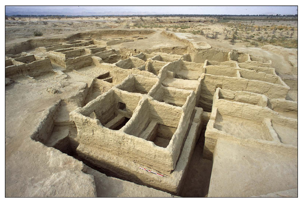
Figure 5. Neolithic mudbrick houses at Mehrgarh, Indus River basin, Pakistan.